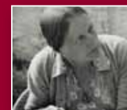
Imogen Clare Holst