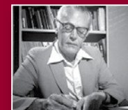
Peter Racine Fricker