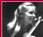
Jacqueline du Pré