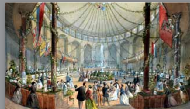
The Albert Hall - suitably dressed for the opening ceremony in 1868